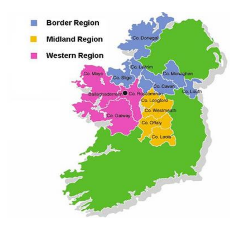
Figure: 1.1: Regions of Ireland