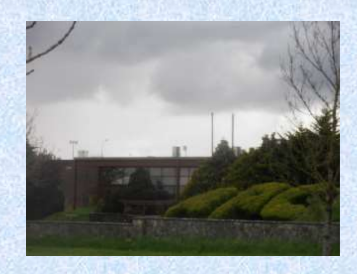
Former American Power Conversion (APC) plant