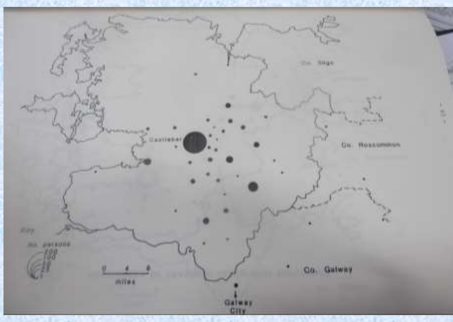
Residence of Travenol employees 1987